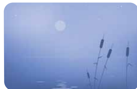
Low light or obscured imaging