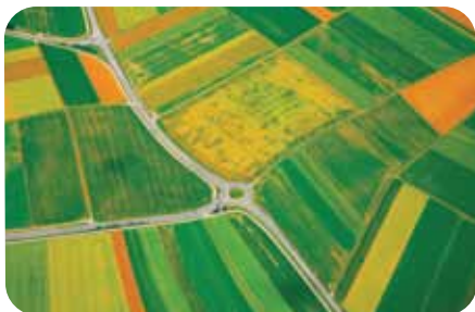
Remote Sensing & Imaging