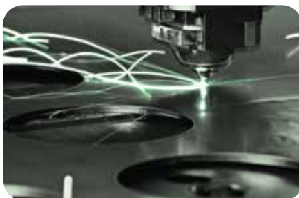
Materials & Manufacturing